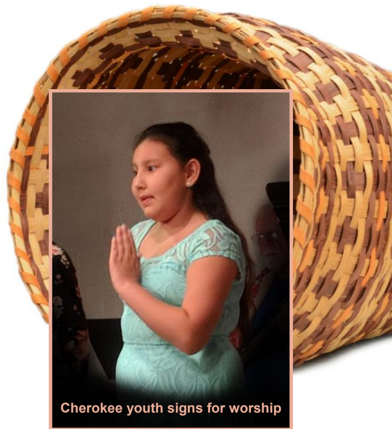
Cherokee youth signs for worship