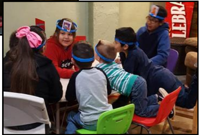
BELOW: A group of mentoring students enjoying the reading center.