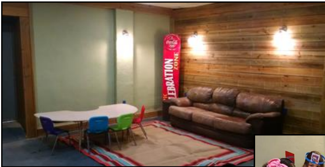
LEFT: The newly remodeled reading room at IMNA's Grace Point Ministry Center.