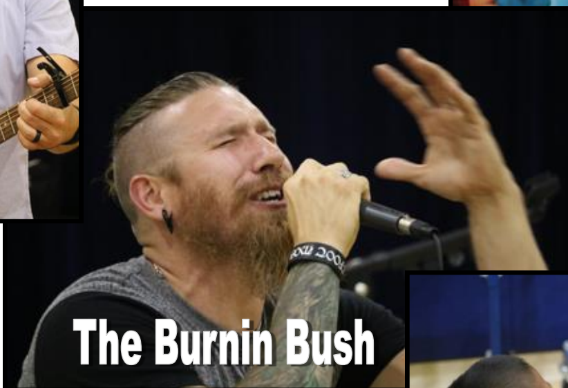
The Burnin Bush