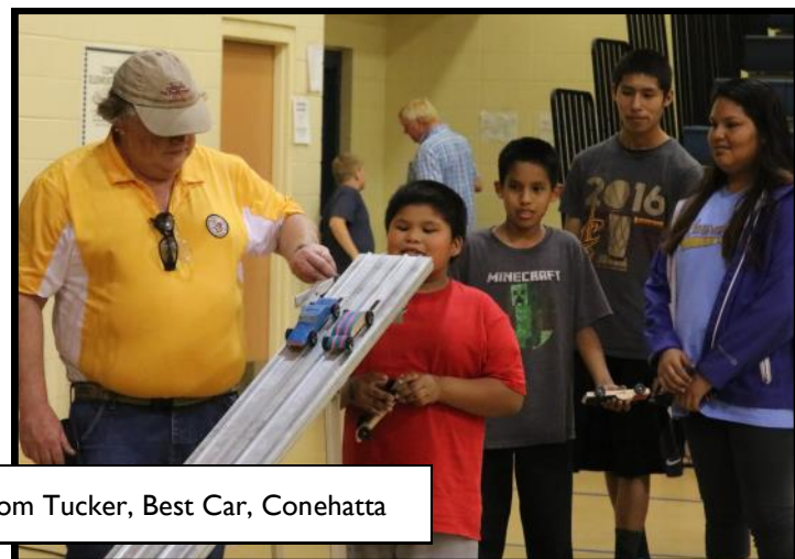
Winners of the Derby: (L-R) 1st from Conehatta, 2nd & 3rd from Tucker, Best Car, Conehatta