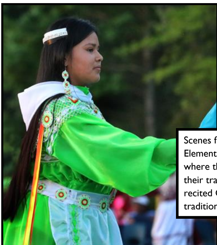
Scenes from the Conehatta Elementary Spring Festival where the children dressed in their traditional attire, danced, recited Choctaw language, and traditional food was served.