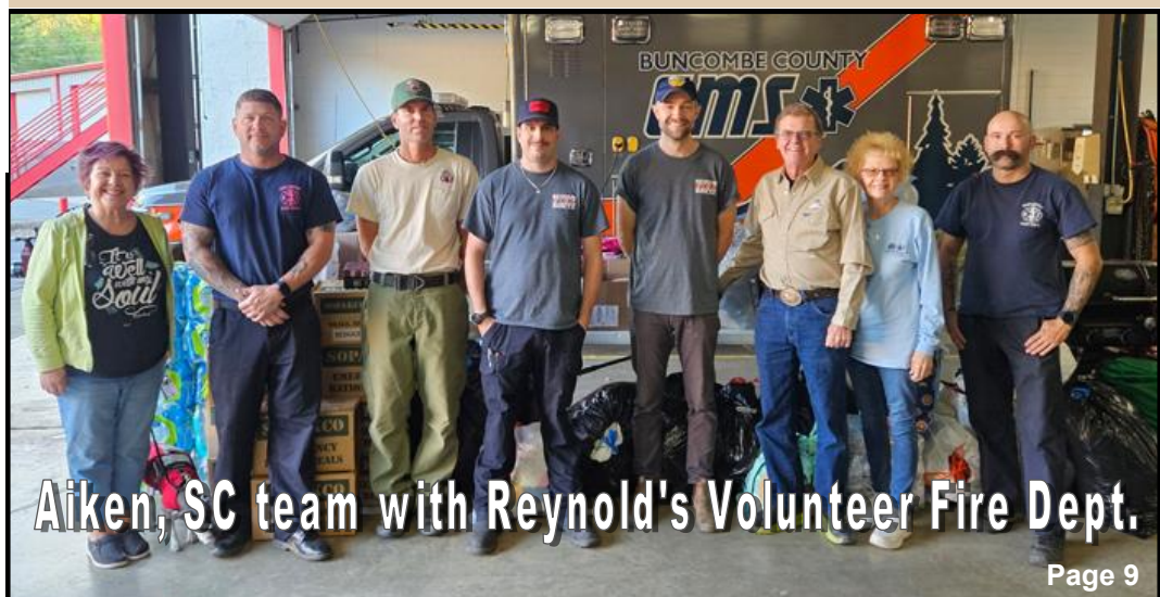
Aiken, SC team with Reynold's Volunteer Fire Dept.