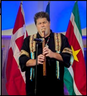
LEFT & ABOVE: Participating in Mission Sunday at North Cleveland Church of God